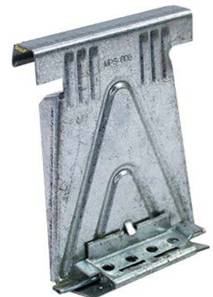
Super Tall CFR Clip 2 ½" Standoff