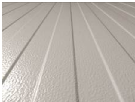
Double Mesa Profile (DM40) with Light Embossed Texture