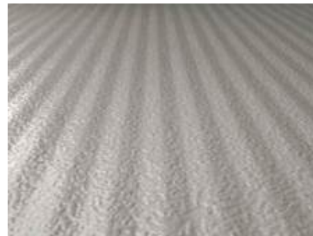
Striated Profile (ST40) with Light Embossed Texture

Critical Dates: Available to order immediately. Contact your local Sales Representative for more information.