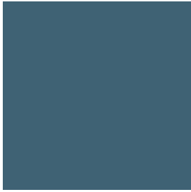
AZTEC BLUE (AB)