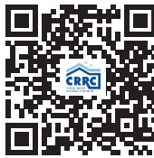
Cool Roof Rating Council Directory