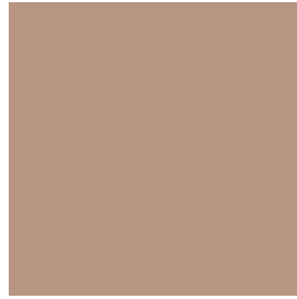
SAGEBRUSH TAN (SA)