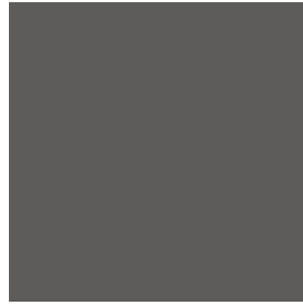
CHARCOAL GRAY (CL)