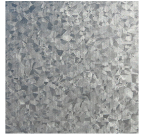
GALVALUME ▲ Non-SMP/PVDF (GM)