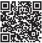
Cool Coatings Spec Sheet

Scan code for the most current Cool (reflective) Roof ratings.♦