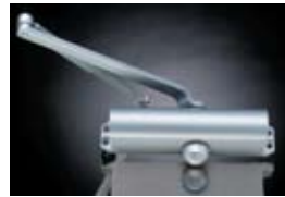
Heavy Duty Automatic Closer