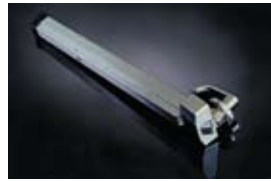
Panic Device with Lever